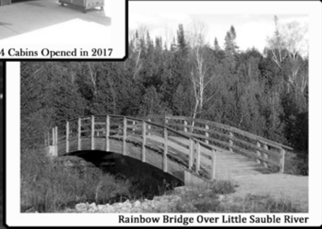
Rainbow Bridge Over Little Sauble River