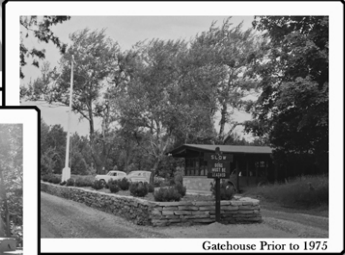
Gatehouse Prior to 1975