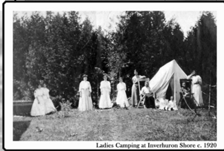
Ladies Camping at Inverhuron Shore c. 1920