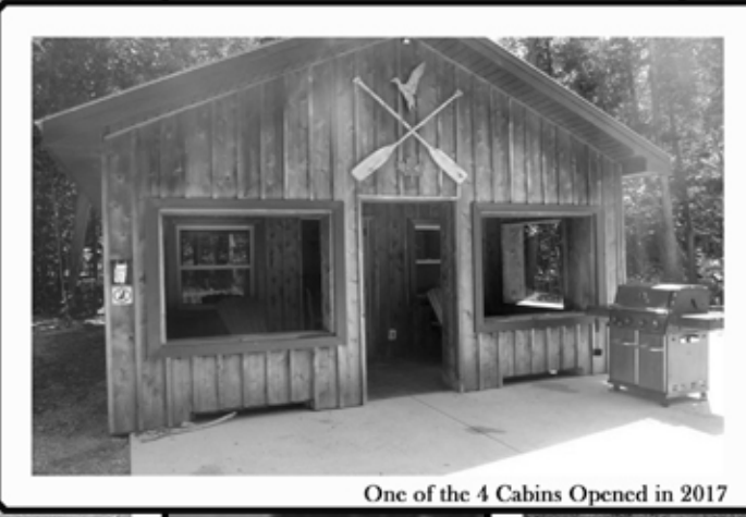
One of the 4 Cabins Opened in 2017