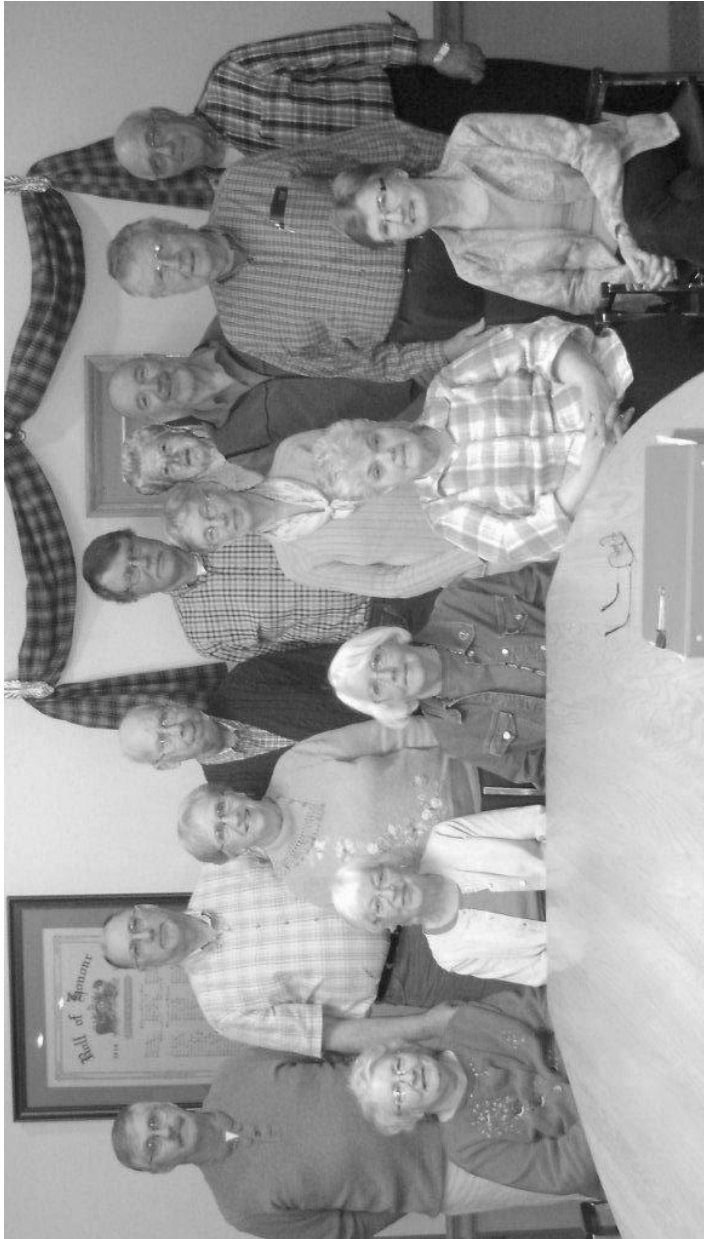
Directors of the Township of Bruce