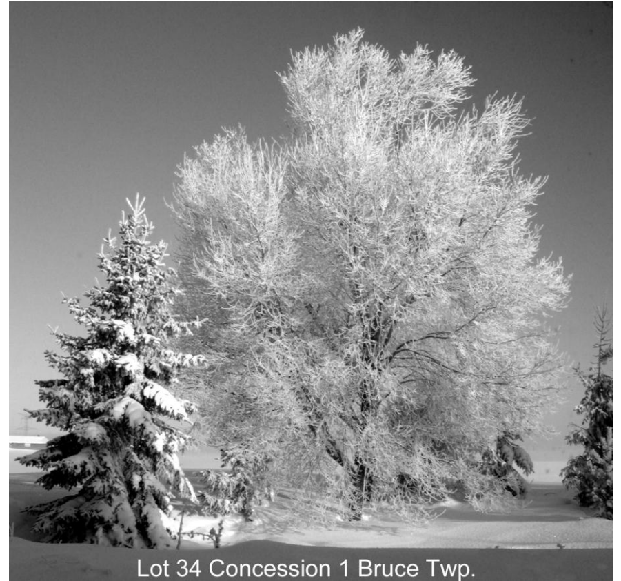
Lot 34 Concession 1 Bruce Twp.

T.B.H.S. Celebrates its 30 th Anniversary