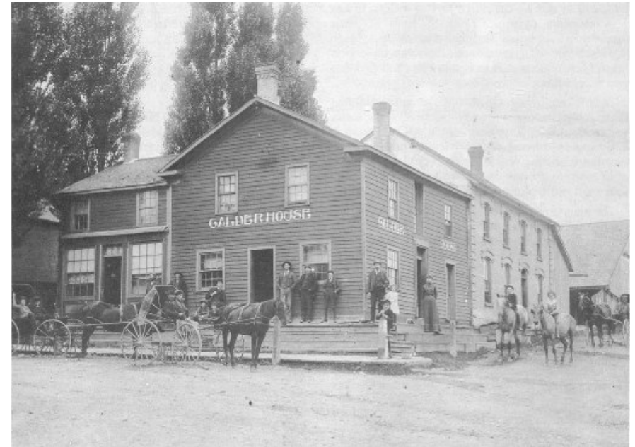
Calder House about 1895

Celebrating the Twenty-Seventh Anniversary of the T.B.H.S